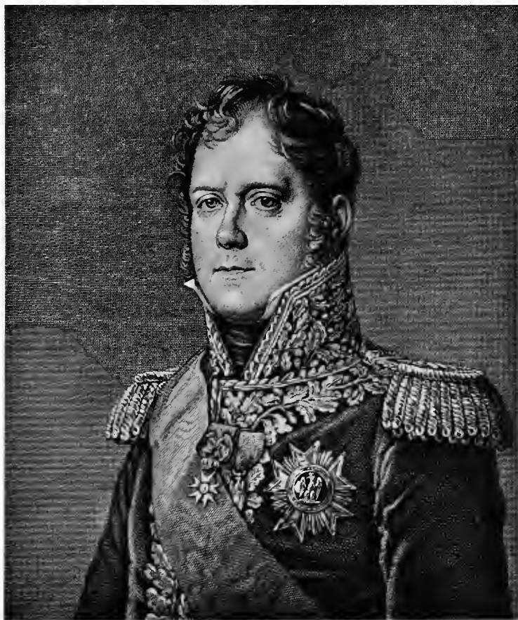
MICHEL NEY, PRINCE OF MOSKOWA FROM AN ENGRAVING AFTER THE PAINTING BY F. GÉRARD